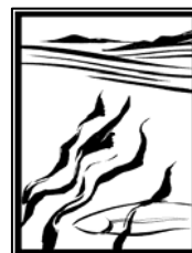
Northwest Straits Marine Conservation Initiative

This report was developed, in part, with funds from the National Oceanic & Atmospheric Administration. The views expressed herein are those of the authors and do not necessarily represent NOAA or any of its sub-agencies. CZM Grant #G0400251, administered by Washington State Department of Ecology and the Northwest Straits Commission, was awarded to Skagit County Public Works Department.