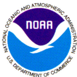
National Oceanic & Atmospheric Administration

Partner Organizations: Samish Indian Nation, Swinomish Tribal Community, Center for the Study of Coast Salish Environments, Port of Anacortes, San Juan Preservation Trust and Shannon Point Marine Center