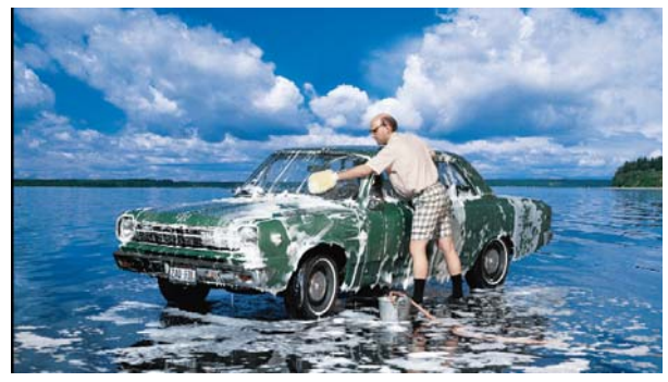
When you're washing a car in a driveway, you're not just washing a car in a driveway.

Keep it clean with StreamGuard™ SudSafe™ Car Wash Kits