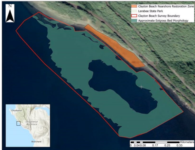
Boundaries of survey and eelgrass