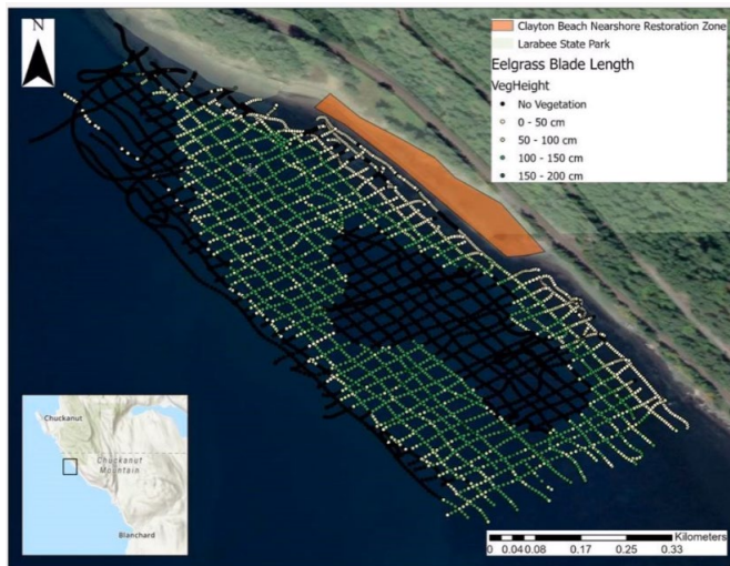
Eelgrass blade length