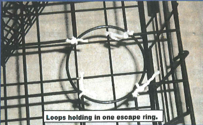
Loops holding in one escape ring.