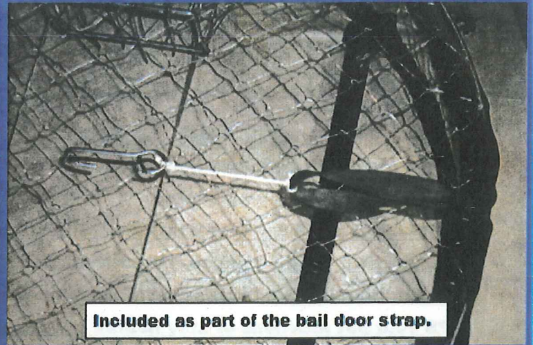
Included as part of the bail door strap.