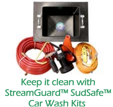
Keep it clean with StreamGuard™ SudSafe™ Car Wash Kits

When you're washing a car in a driveway, you're not just washing a car in a driveway.